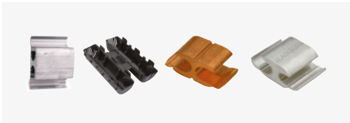
Aluminum and copper H-tap connectors and covers