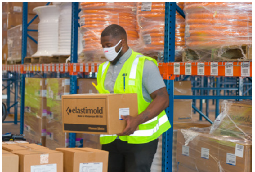
ABB Installation Products utility products storm hardening and grid resiliency brands