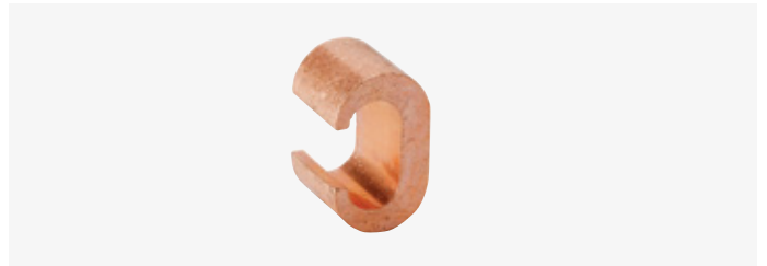
Copper C-type compression taps