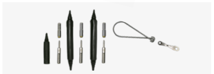
Storm-Safe® service entrance breakaway connectors