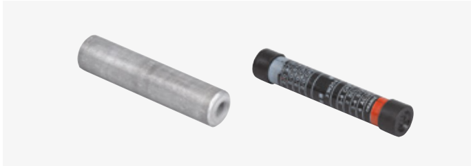
Insulated and uninsulated service entrance splices — 840 size

The featured products below are available for immediate delivery when you need them most.*