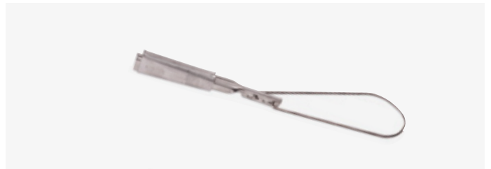
Service entrance wedge clamps