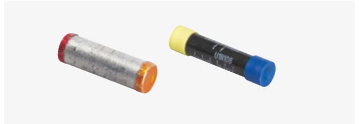
Insulated and uninsulated service entrance splices — 5/8 size