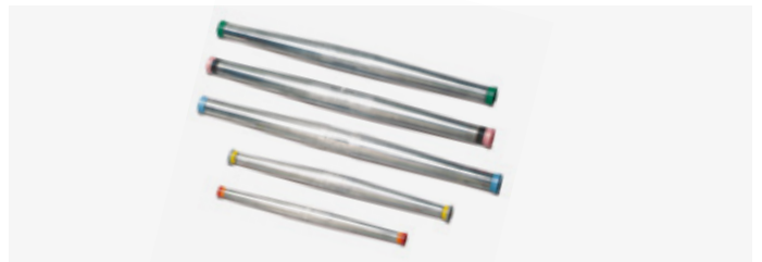
Automatic tension splices